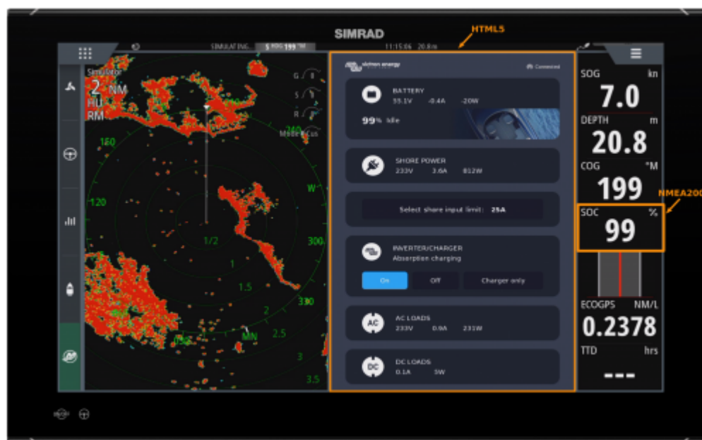
Picture showing the two integration options, NMEA2000 and HTML5 App. Click to see full size and see the difference between the two.

Make sure to closely read this full document to find the best method for your type of system.