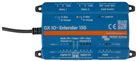
GX IO-Extender 150