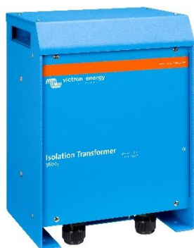
Isolation Transformer 3600W