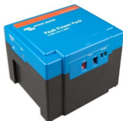
12.8 V, 20 Ah