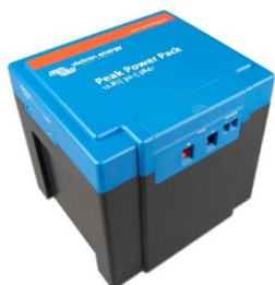
12.8 V, 30 Ah