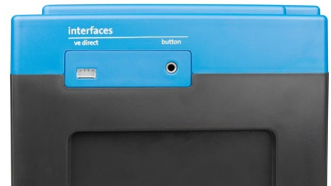
VE.Direct and push-button