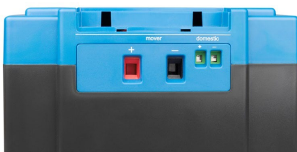
High capacity output (mover) and low capacity output (domestic)