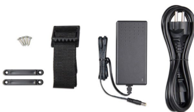
Fixing strap Adapter Power cable Push-button with cable (2m) and dual-colour LED