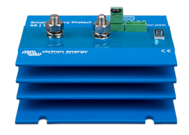
Smart BatteryProtect BP 48-100