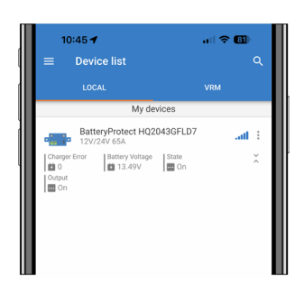
Instant Readout via VictronConnect